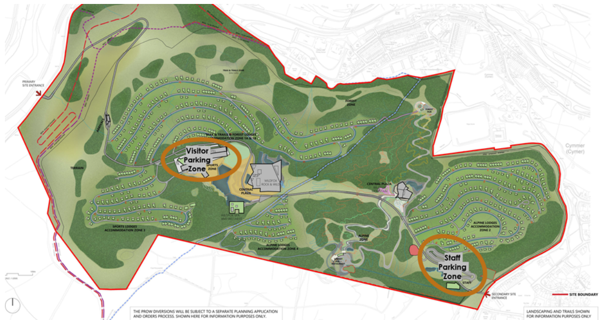
Figure 1 - Concept Masterplan Extract (for information purposes only)