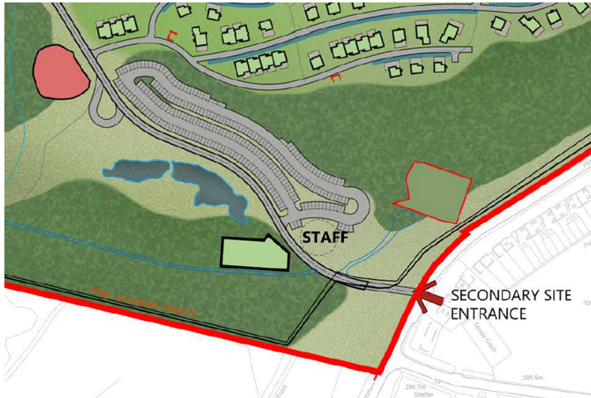
Staff Car Park - 250 Spaces (for information purposes only)