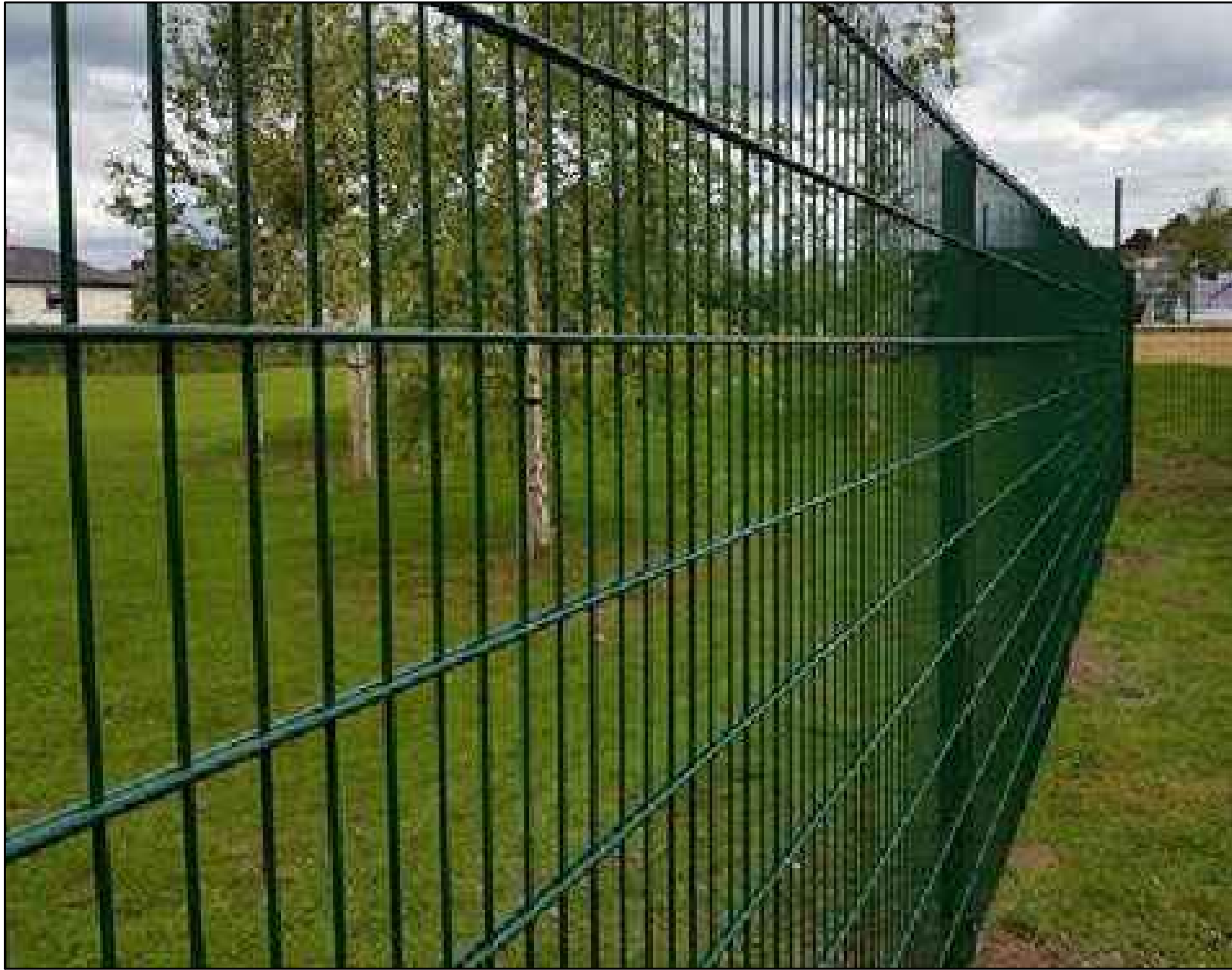
6 L-06 FENCE IMAGE (not reflecting colour choice)

The scaling of this drawing cannot be assured