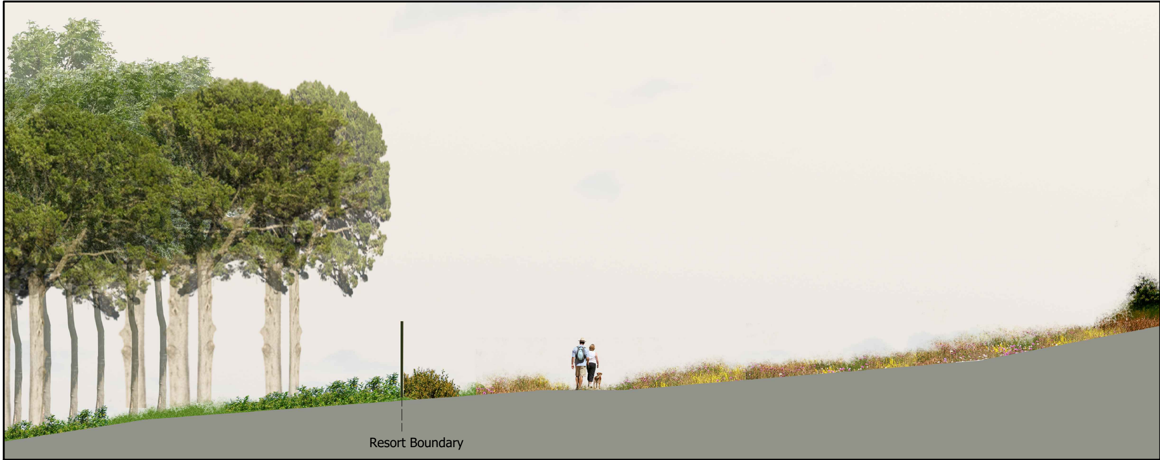
1 L-06 SECTION 1