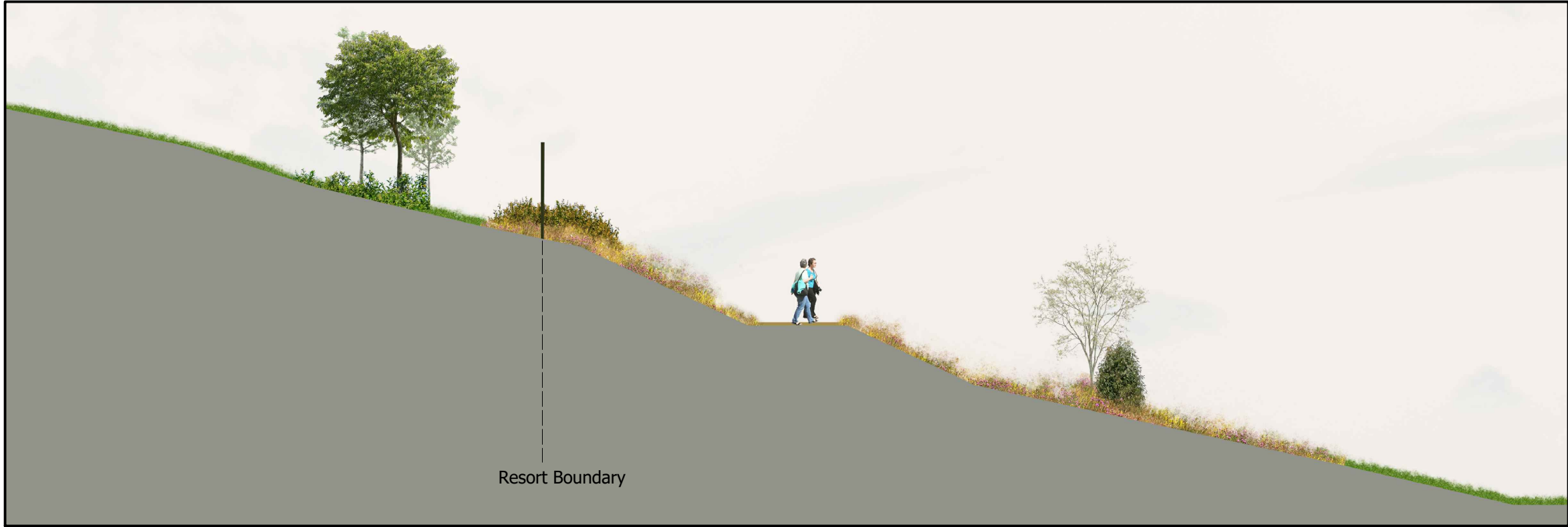
2 L-06 SECTION 2